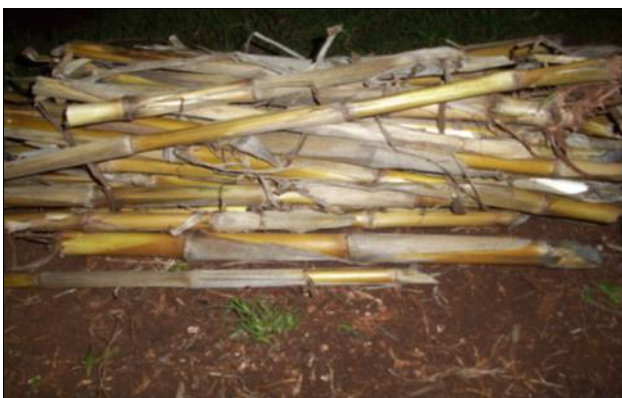
Plate 2: Dry maize stalks

The study also found that households with some wood fuel available still used maize cobs and stalks after the harvest season and postponed use of wood. Maize cobs were commonly used to boil foods and warm water (Plate 3). However, they were unpopular with households because of their tendency to smoke. When households lacked the time to source for split wood they would resort to using dry maize stalks. Maize stalks were used as an alternative to split wood (Plate 2). Maize stalks were also unpopular because a household required a big bundle to make a meal and they burned out fast forcing one to keep feeding the fire with more. Though, most respondents indicated that maize stalks burned out quickly and therefore one has to use much of them whenever they are used as alternatives at the time of serious wood fuel shortages.