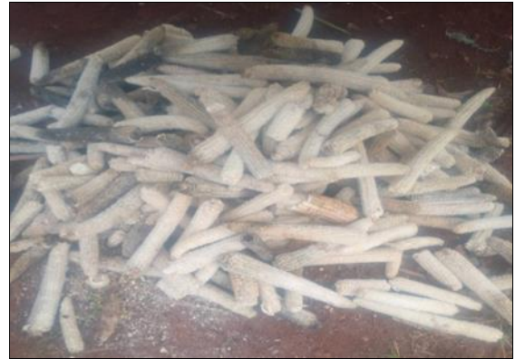
Plate 3: Dry maize cob

Slightly, less than a third (16.8%) of the households in the study area used alternate energy sources of fuel such as kerosene, biogas, solar, LPG and electricity in times of wood fuel scarcity (Table 4). The energy sources were used for cooking, heating and lighting in the developing world (Heltberg, Channing & Sekhar, 2000) [20]. However, household respondents do not afford the alternative energy sources sustainably because of high prices attached to them (Githiomi, 2010) [15]. For instance, in Lurambi District, Kenya, alternative energy sources provide an effective source of fuel in times of wood fuel scarcity (Githiomi et al. , 2012) [17]. Among the households, 10 percent cited the use of alternative sources of energy for wood fuel as per Githiomi, (2010) [15]. This is comparable to Akther (2010) [1] in a study on household adaptation to wood fuel shortage among 60 households in Bangladesh found that 23 percent of the households adapted to wood fuel scarcity by use of alternative sources of energy.