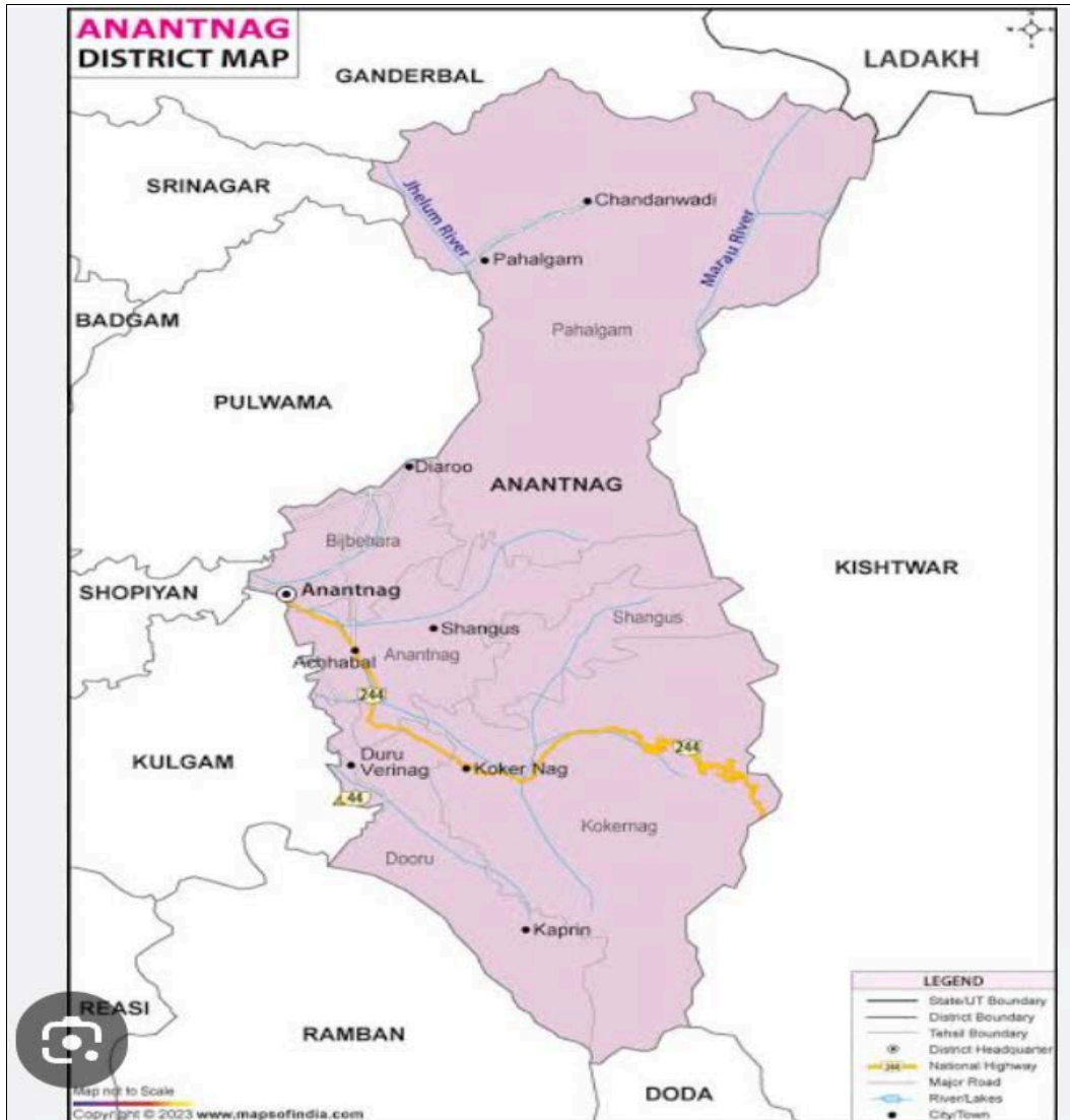
Fig 1: Location map of Anantnag district.

maize, pulses, vegetables and fodder, potato and oil seeds (Department of Agriculture and Farmers Welfare District Anantnag). Plantation of medicinal plants, willows, popular and keeker also contributes in the economic development. More than 30% agricultural land in the district has been diverted to horticultural land leaving only about 60 to 70% land under agricultural purposes. The total cultivated area of district is 21597 hectares out of which 18392 hectares are under irrigated area and 19542 are under remaining sown area (Fig. 1).